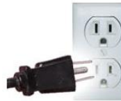
Tipo B: A veces válido para clavijas A