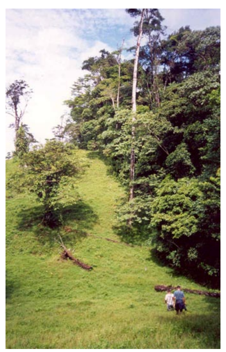
Land-use change can dramatically change biodiversity, with strong impacts on ecosystem properties and the various services they provide to society