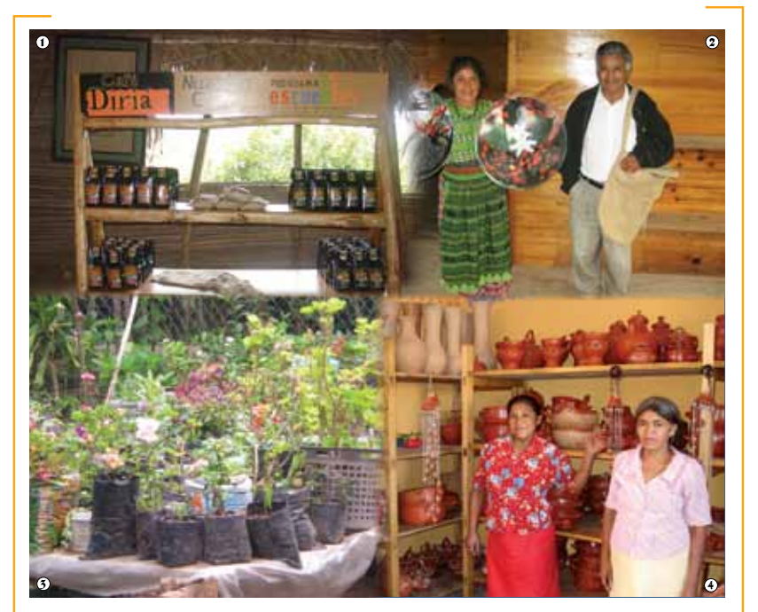
Economic diversification in activities complementary to coffee has been a successful strategy in various places across the region. A few interesting examples are the promotion of agro-tourism, such as the 'coffee tour' (Diria Coffee Tour of Coopepilangosta, Hojancha, Costa Rica¹ and Coffee Tour of ASUVIM, Sololá, Guatemala) and the creation of eco-parks (Ecological Park of San Pedro Volcano, Sololá, Guatemala²). Other examples include the commercialization of potted flowers (Women's Cooperative of Bellavista, Caahoatán, Mexico³), handicrafts such as pottery (Micro-Enterprise of Pottery of Lencas Pala, Lempira, Honduras¹), textiles and beads (Women's Association Ix Luna, Sololá, Guatemala).

Social organization. Farmers recognize organization as one of the more important strategies by which to address global change, at the same time recognizing that the organization process poses its own challenges. On the positive side, organization facilitates access to better