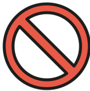
Area of Study