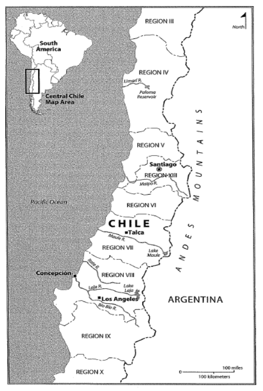
Map 1. Central Chile