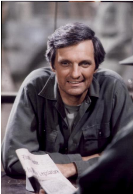
Alan Alda, MASH