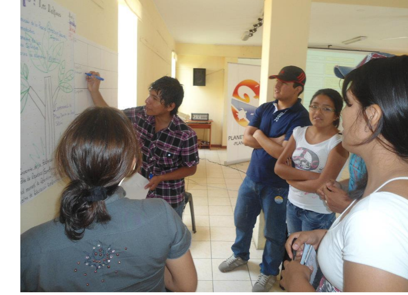
2. Youth-lead project incubator